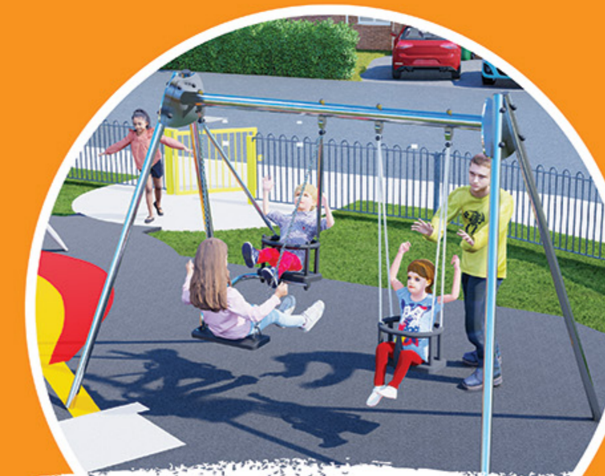
ME TO YOU $ CRADLE SWINGS