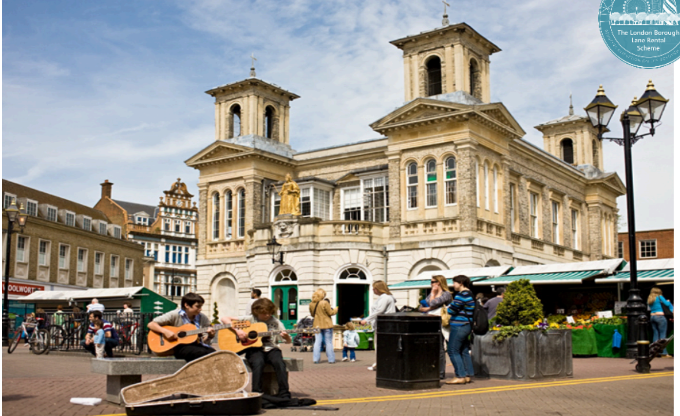
The Royal Borough of Kingston Upon Thames