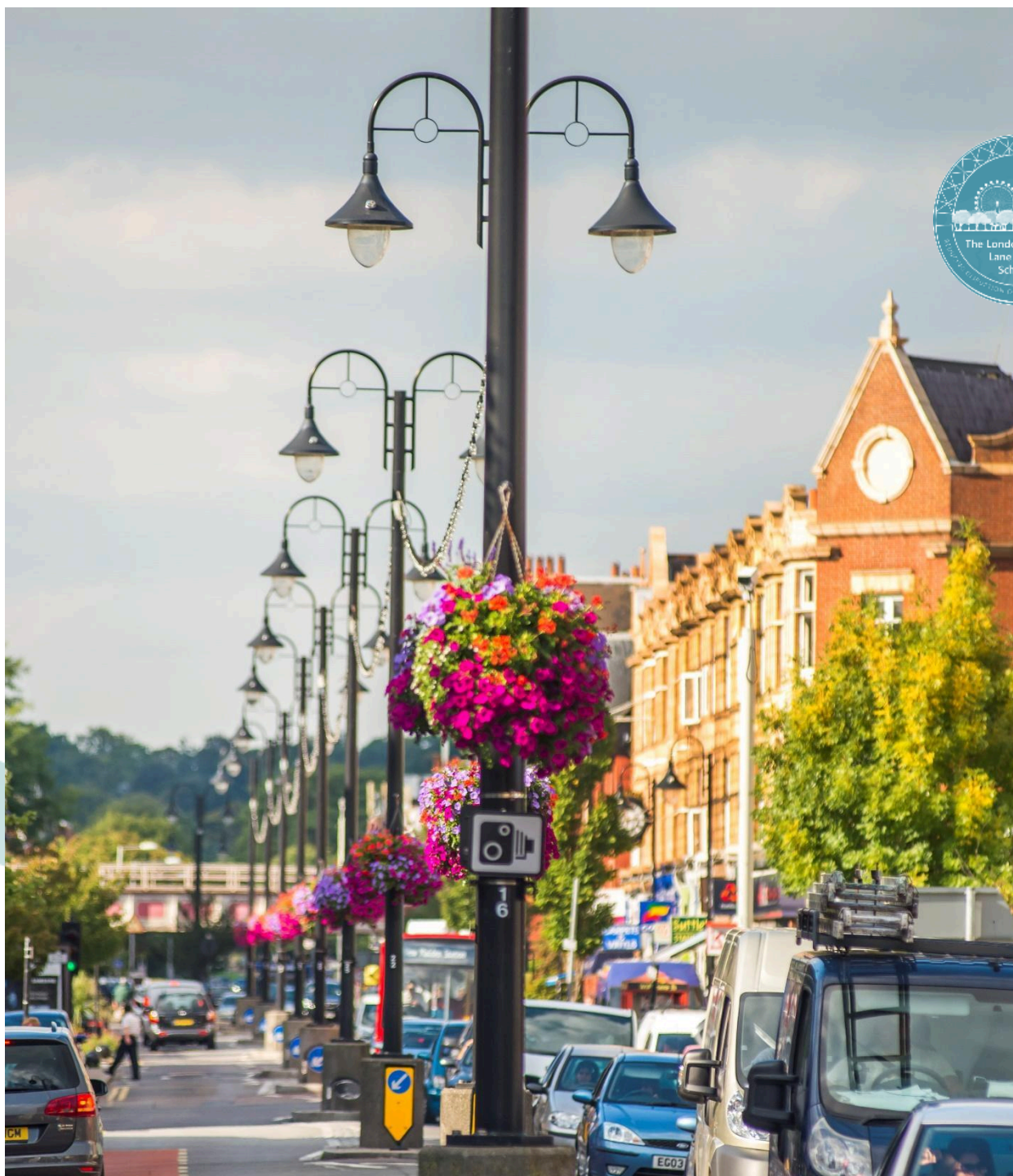
London Borough Lane Rental Scheme. Reducing disruption on the Borough Road Network