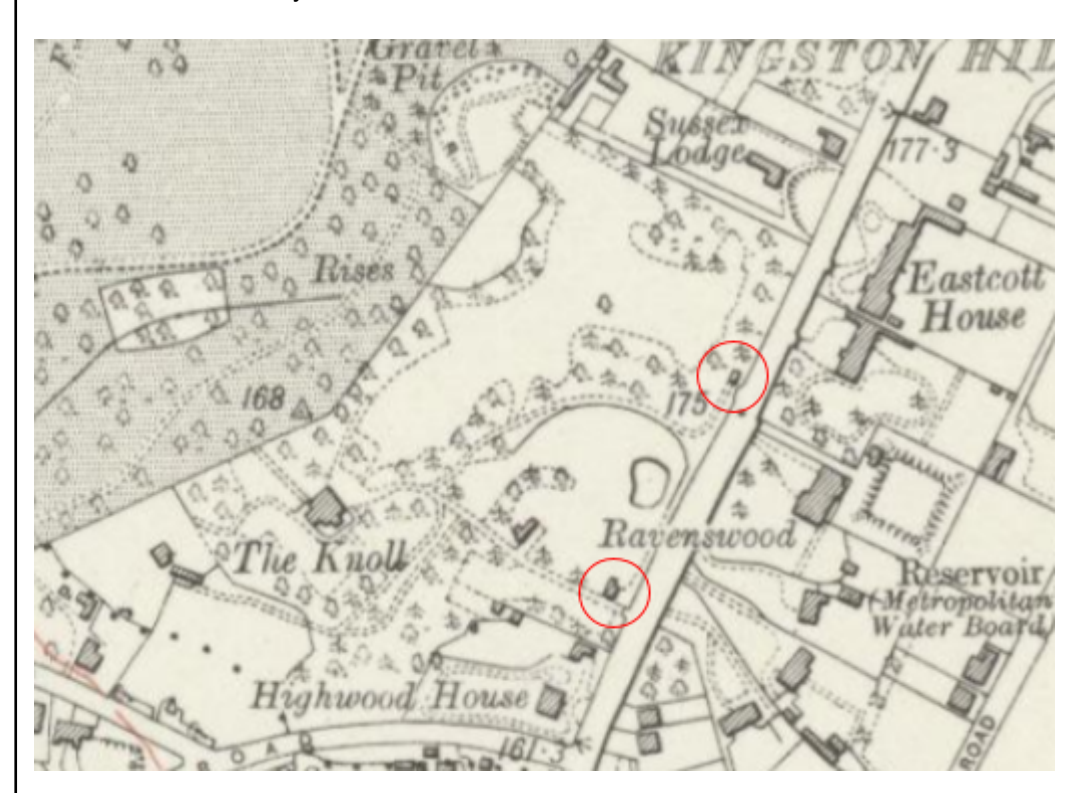
Extract from OS Surrey Sheet VII.SW, Revised 1938, Published 1944

Extract from OS Surrey Sheet VII.SW, Revised 1911, Published 1920